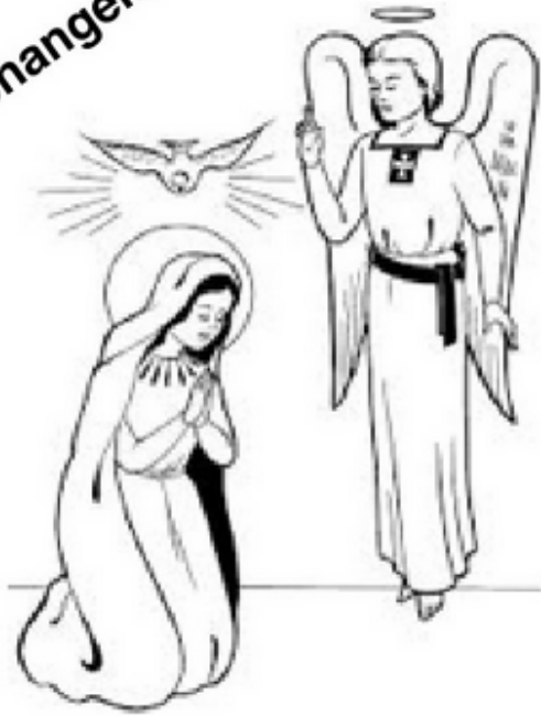
St. Gabriel the Messenger Archangel