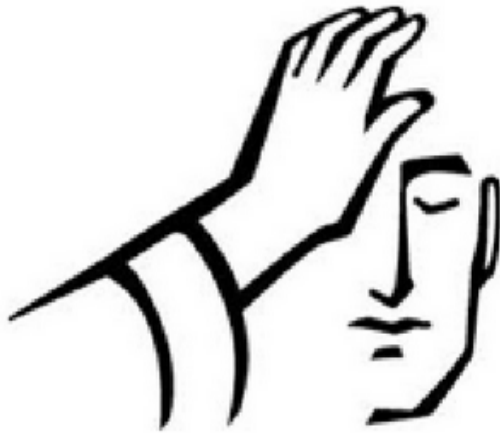
St. Raphael the Healing Archangel