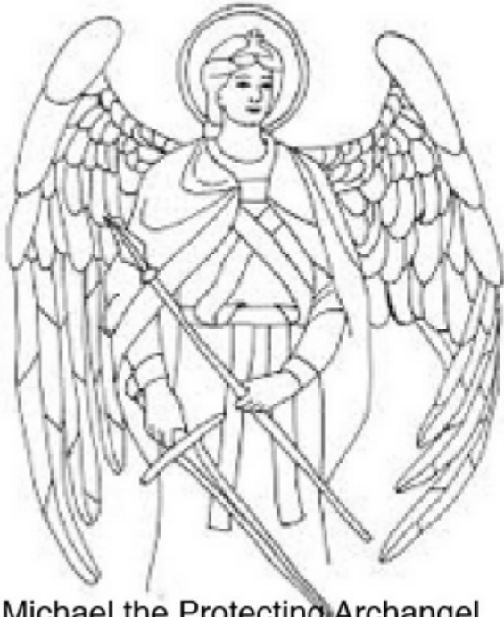
St. Michael the Protecting Archangel